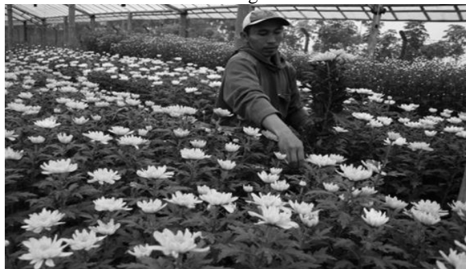
Figure 1: Green House Cultivation Chrysanthemum Kulo and Riri On Tomohon

While this is still conducted trials of planting special flowers Chrysanthemum Kulo and Riri in Show Window area that only grows in Tomohon. Chrysanthemum tomohon larger in size than the chrysanthemum in other areas such as image 1, the special so it was named the mascot of Tomohon on the implementation of Tomohon International Flower Festival, which is attended by participants from abroad. Now the interest will be the economic driving Tomohon also turned its citizens.