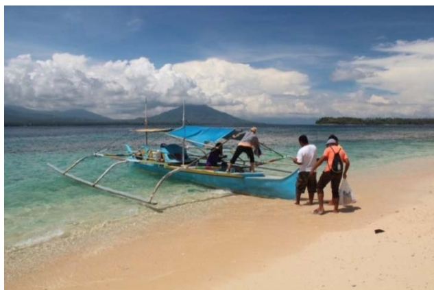
Figure 2: Changa/Ketinting

Kakara Island is included in the small island category. It has a fairly extensive forest land compared to residential area, because the small part of it is used for housing and yards, and the big part is for the local's plantation. As shown in Figure 10, the local's settlement is structured long L-shaped line following the coast, with a long row of settlements of approximately one kilometer. The population of Kakara village is as many as 789 people, consisting of