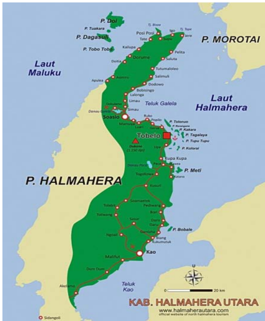
Figure 3: Map of North Halmahera Regency ( http://www.halmaherautara.com/map/peta-kabupaten-halmahera-utara )

population recorded in Tobelo with 33,719 people, while the sub-district of Kao Bay is the least with the population of 3,933 people. Geographically, North Halmahera Regency is located in the coordinate position of 10,57'-20.0 'North latitude and 128,17'-128.18' east longitude. This district extends for about 22.507,32 km 2 , which consists of 17.555,71 km 2 (78%) marine territory and 4.951,61 km 2 (22%) of land territory. Administratively, North Halmahera Regency is bordered by Morotai Island in the north, East Halmahera regency in the east, and West Halmahera Regency in the south and west.