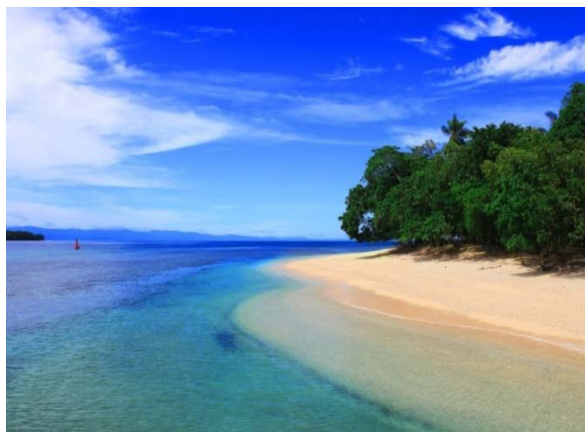
Figure 3: Beach on Kakara Island

354 men and 435 women, with 178 families. Occupations of Kakara residents are fishermen, farmers, dockers and civil servants. (Source: Central Bureau of Statistics/BPS of North Halmahera). It can be explained that Kakara Island has the potential on marine tourism with its white sandy beach, crystal clear water and spectacular underwater biodiversity. The beauty of the beach at cape Kakara can be seen in Figure 3 below.